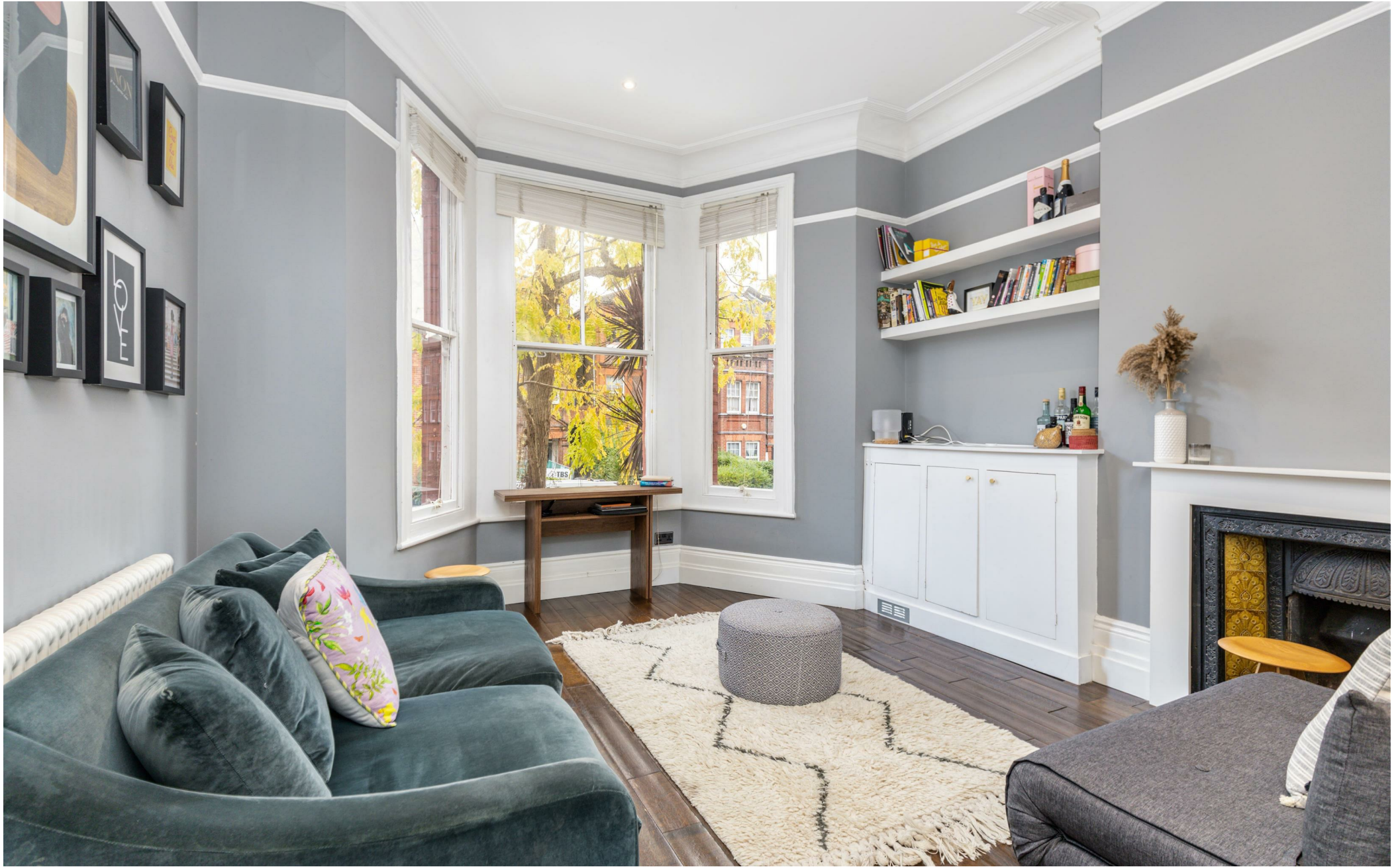
Goldhurst Terrace NW6